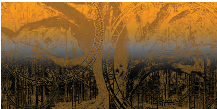
Dawn Dedeaux, The End: with Big Oak, Ladders & Rings , 2013, digital drawing on archival paper, 49 x 96 in.