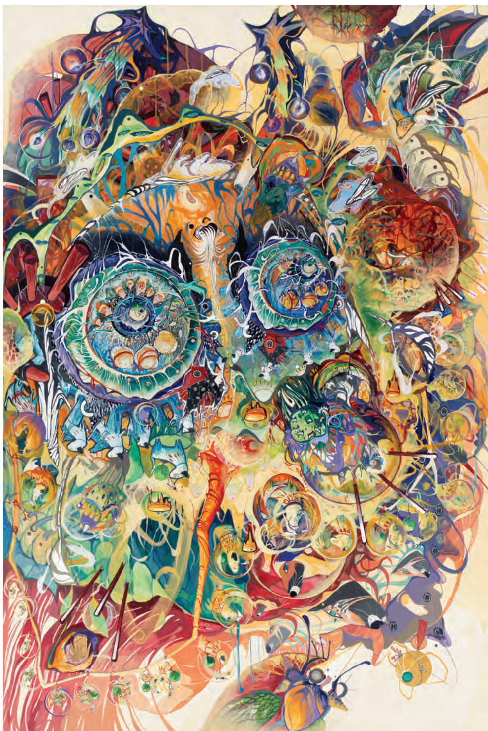
Mi Ju, Full Moon , 2009, acrylic on canvas with cut out paper, 72 x 48 in.